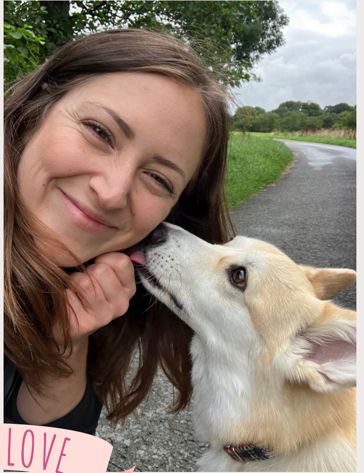
WITH LOVE EMILY